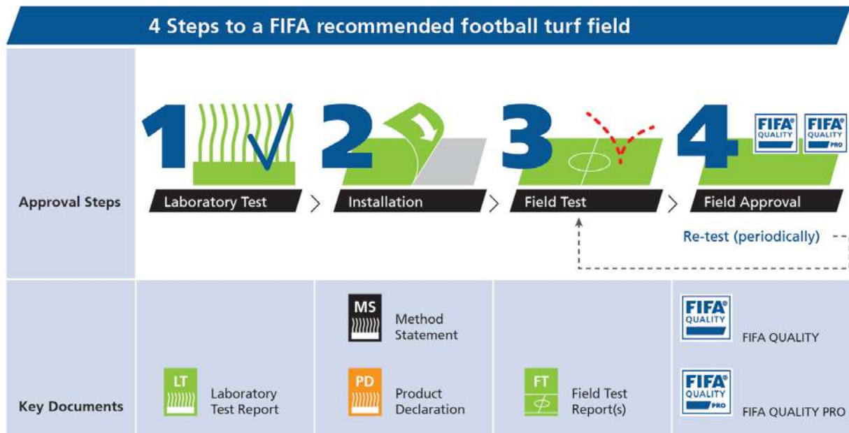
Fig. 1.2 Approval process steps and the related documents / parties

The FIFA Quality Programme is the certification of a particular field that has been found to fully meet the requirements of the Quality Programme. It is not the approval of products. In order to be certified, football turf fields must reach the performance and quality criteria established to provide the best possible playing conditions. To this end, each field must undergo four steps as outlined below: